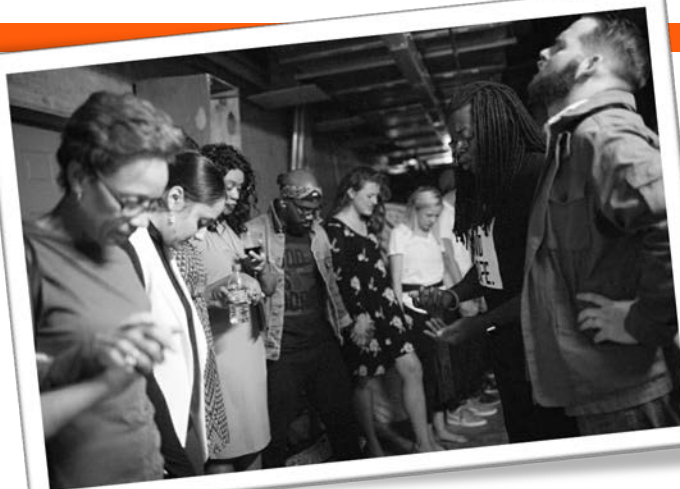
Photo taken at The Listening presents Spencer's Vanguard "A Journey In Identity"

For information on how you can donate or volunteer please contact TheLamp@simplyredeemedt335.com